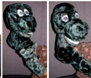
Dino Mom - young dino set

These are good sized rod puppets and have wired fingers for gestures and holding props $80.00 each