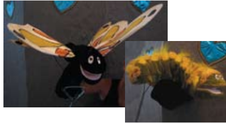
Butterfly & Caterpillar Set

Human hand puppet with both gloves. Use either hand, or stuff one and have him hold a prop with one. Wears size 4 shirt $90.00